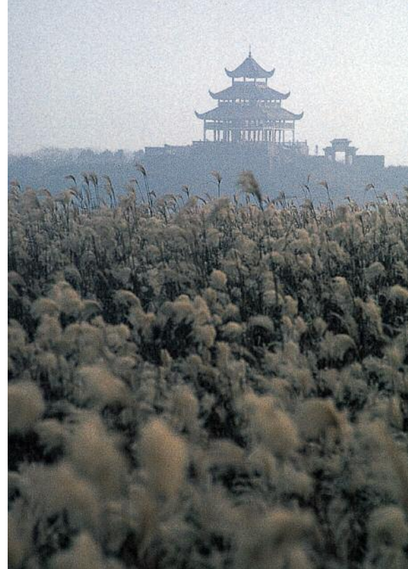
Reeds, like these in Poyang Lake Ramsar Site, China, remove pollutants from the water.

Of course nature has its limitations, and it would be wrong to consider that wetlands can deal with whatever types and quantities of waste we humans can produce. This was vividly demonstrated by two environmental disasters in Europe, in which storage reservoirs holding toxic wastewater from mining failed. In southern Spain, in 1998, more than 5 million cubic metres of sludge laden with heavy metals poured into the Guadiamar River, threatening the world-famous Doñana wetlands (a Ramsar Site). Over 4,500 hectares were affected and the clean-up bill for the regional government reached EUR165 million. Less than two years later, in Romania, 100,000 cubic metres of wastewater containing cyanide and heavy metals flowed into a tributary of the Danube River, contaminating 1,000 kilometres of river ecosystems in Romania, Hungary, Serbia and Bulgaria.